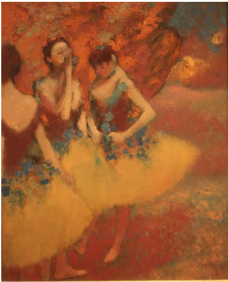
Edgar Degas (1834-1917), Three Dancers in Yellow Skirts (c. 1891) Detroit Institute of Arts

In Degas' Three Dancers how are the dancers looking, seeing and sensing? How does this connect to the Gospel passage and the request to see Jesus and Jesus' response in metaphor about wheat, grain and abundance?