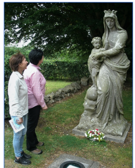
The Statue of Our Lady of Ellon

With appetites increased by the exertions of the “Guided Prayer Walk” we adjourned to the churchyard of Saint Mary-on-the-Rock. As brilliant sunshine now broke through the hazy clouds, we relaxed in chairs set up around the church. Some preferred the cooler shade beneath trees whilst others soaked up the warmth of the sun, but everyone was glad for the opportunity to sit after the walk. In the fresh air our lunches tasted exceptionally good as hungrily we tucked into our food. But what made the al fresco dining even better was the shared companionship and conversations that we enjoyed together.