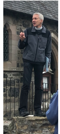
‘Rector on the Rock’

Converging on the car park at Saint Mary-on-the-Rock on Saturday morning, 24 th July, people, and canine pets came together for a “Guided Prayer Walk.” Commencing at 11:00 with a ‘Gathering Prayer’ led by the Dean of Aberdeen & Orkney, the group set off from the church heading in the direction of the town centre.