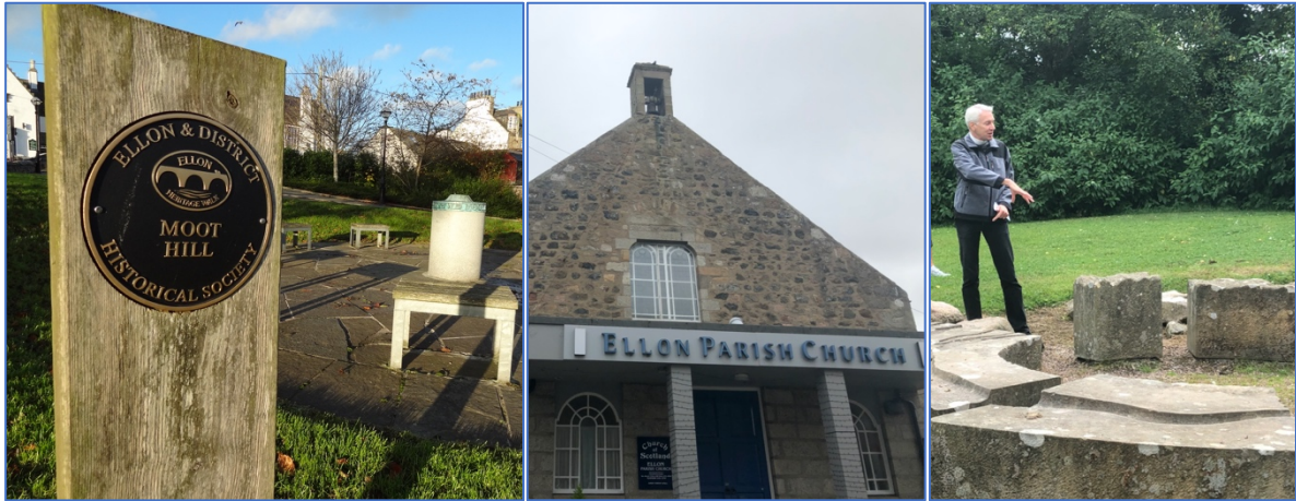
Three of the prayer stations.

Throughout the walk there were four ‘Prayer Stations’ focusing on the nation, the departed, creation and education. A common intention linking all four of these prayers was expressed in these words from the opening prayer: “may today’s shared journey bring us closer together in love and understanding of one another.”