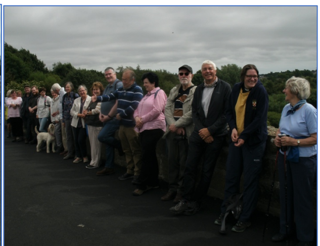
The group on the old Railway viaduct (also the site of a prayer station)

The Ythan viaduct used to carry the Dyce-Fraserburgh (Buchan) line of the former Great North of Scotland Railway over the River Ythan.